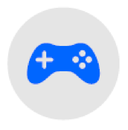
Online games can enhance teamwork and creativity