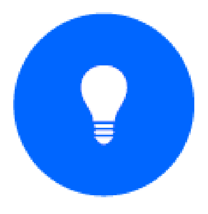
Add to the child's store of knowledge